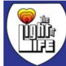
St. Ann's High School – Madinaguda